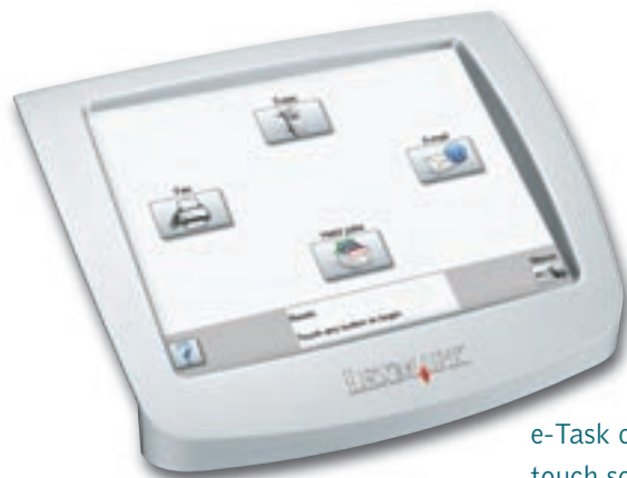
e-Task colour touch screen

Boasting Lexmark's unique e-Task colour touch screen, the X850e and X854e are easy to use, even for first-timers.