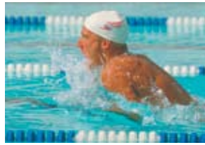
Without HD Color technology