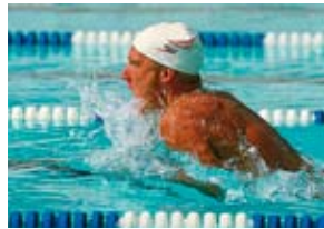
With HD Color technology